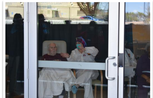
Participants enjoy a socially distant music therapy program while receiving care at the Summit Infirmary.